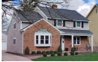
1544 Guilford Road $900,000