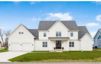
9151 County Road 254 $705,000