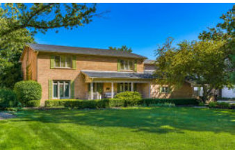
280 Eastmoor Boulevard $603,000