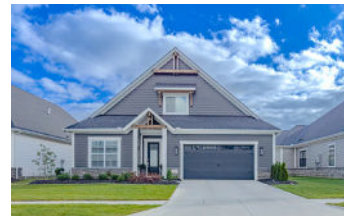
5527 Seclusion Drive $649,900