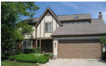
744 Stewart Court $395,000