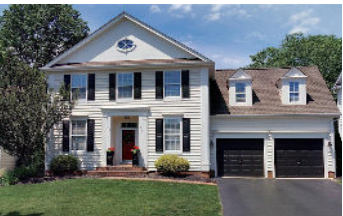
5061 Ederton Place $605,000