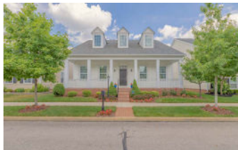
5092 Heartstone Park Drive $465,000