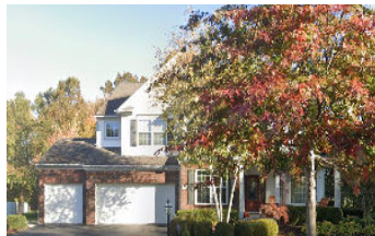
5737 Alston Grove $601,250