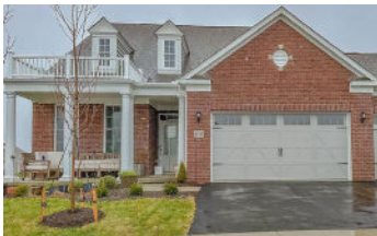
6158 Nottingham Loop $605,042