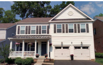
1377 Leesland Drive $605,000