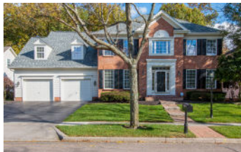
4128 Audley Road $615,000