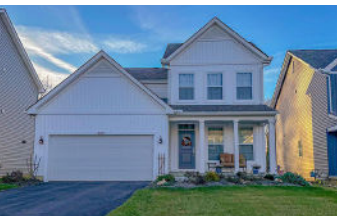
6307 Celeste Street $400,161