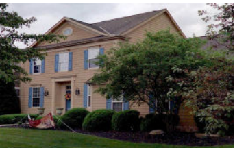
7161 Talanth Place $705,000