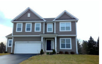
6035 Weeping Rock Drive $540,000