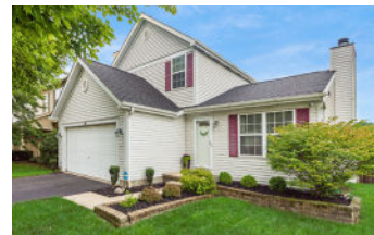
888 Bledsoe Drive $290,000