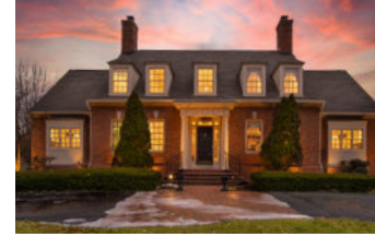
4301 Olmsted Road $870,000