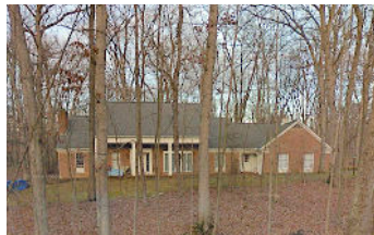
9175 White Oak Lane $426,800