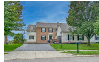
6977 Cunningham Drive $565,000