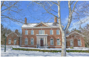
4737 Yantis Drive $2,200,000