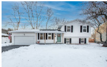
755 Granby Place W $410,000