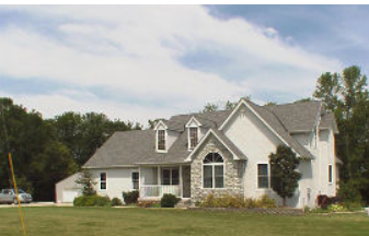
14501 Center Village Road $750,000