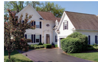
7095 Fernridge Drive $650,000