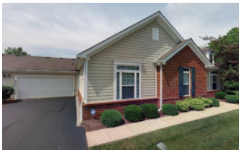
6886 Marigny Avenue $450,000