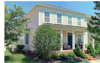
5054 Notting Hill Drive $467,000