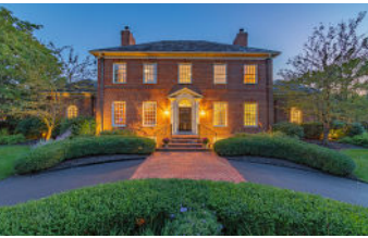
4545 Northgate $1,850,000