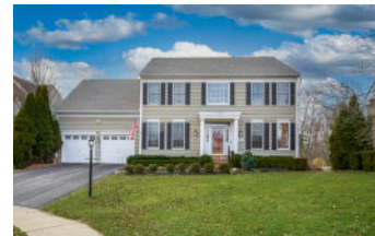
7015 Harlan Square $650,000