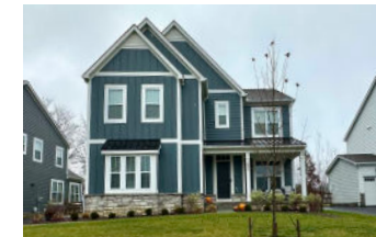
2906 Mound Ridge Way $644,861