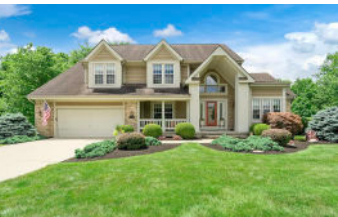
13514 Old Gate Drive NW $510,000