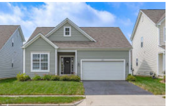
6801 Brooklyn Heights Road $410,000