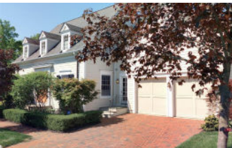
38 Pickett Place $715,000