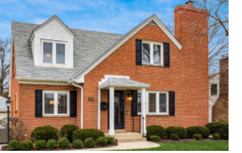
2360 Cambridge Boulevard $760,000