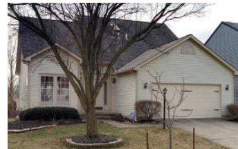
4891 Hawkstone Road $420,000