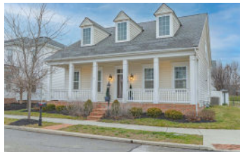
8062 Loomis Drive $507,000