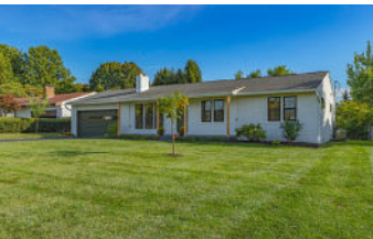
2423 Eastleft Drive $535,000