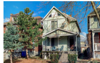
1270 Eastwood Avenue $489,900