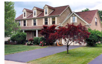
6997 New Albany Links Drive $619,000