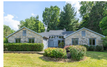
6735 Walnut Street $575,000