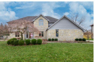
239 Crossing Creek N $612,500