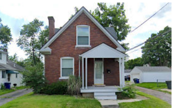
1371 Sunrise Avenue $370,000