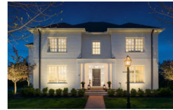
7165 Ashcombe Court $1,300,000