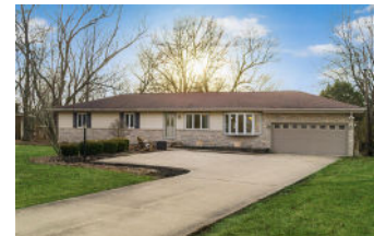
6435 Harlem Road $420,629