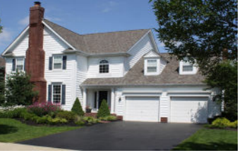
5216 Sugar Run Drive $775,000