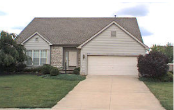
6790 Highbridge Place $445,000