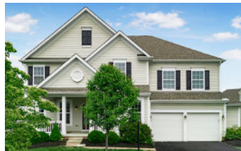
8427 Tournus Way $670,000