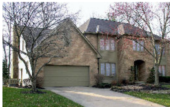
604 Brook Run Drive $560,000