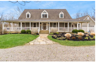
3937 Headleys Mill Road SW $1,100,000