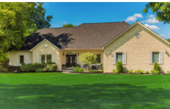
3931 Berrywood Drive $610,000