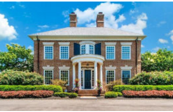
7779 Lambton Park Road $2,100,000