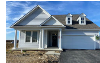
6152 Nottingham $473,570