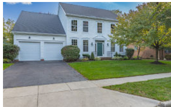
7407 Hampsted Square N $699,900