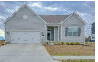
193 Preserve Drive $460,900