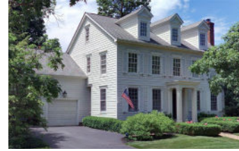
4597 Neiswander Square $889,000