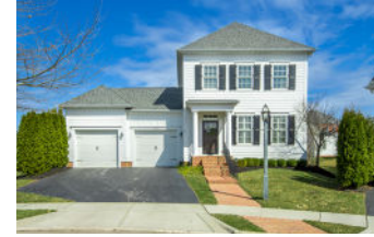
7930 Cole Park N $810,000