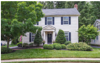
5249 Settlement Drive $535,000