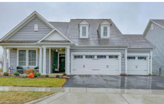
7797 Westcross Drive $448,200