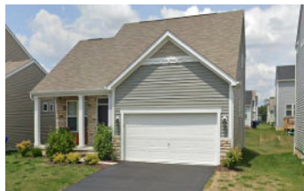
5956 Kilbeggan Street $365,000