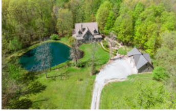
1919 Hazelton Etna Road $953,000