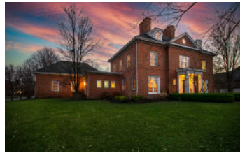
3933 Farber Court $1,460,000