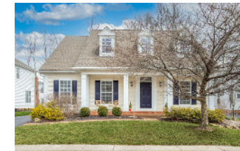
5264 Settlement Drive $570,000