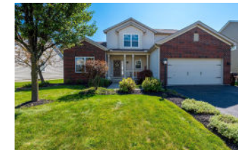
578 Preston Trails Drive $417,000