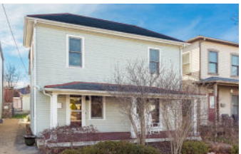
161 4th Avenue $365,000