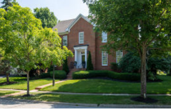
4568 Neiswander Square $900,000