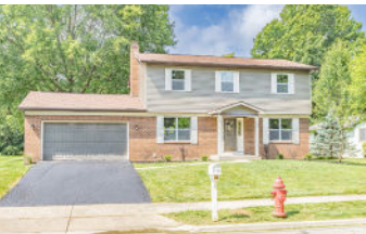
879 College Avenue $457,000