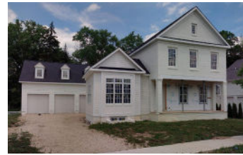
7020 Oxford Loop N $1,365,000