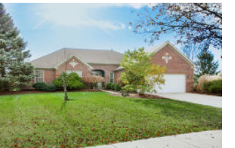
1101 Northwood Circle $536,000