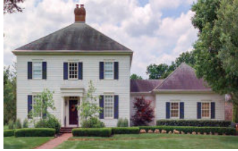
4075 James River Road $780,000