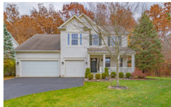
4376 Cordova Drive $600,000