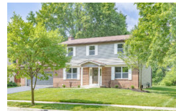
879 College Avenue $291,500