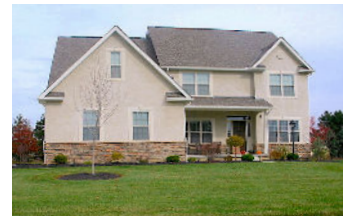
7735 Early Meadow Road $595,000