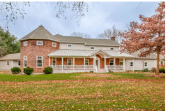
6300 Harlem Road $985,000