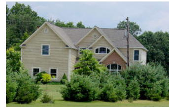
8280 Walnut Street $1,450,000