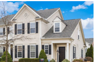
8187 Parsons Pass $460,000