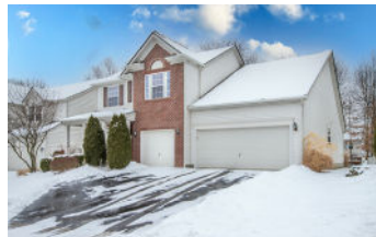
6401 Summers Nook Drive $490,005