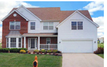
4176 Wyandotte Woods Blvd $615,000