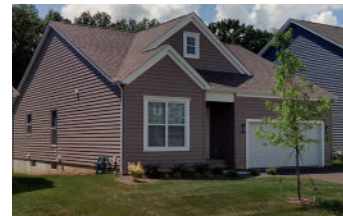
2781 Newbern Drive W $422,500