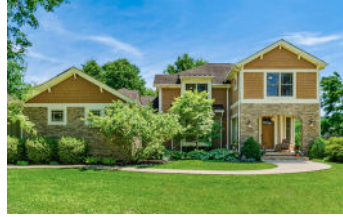
6846 Lee Road $900,000