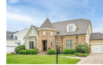
4217 Village Club Drive $812,000