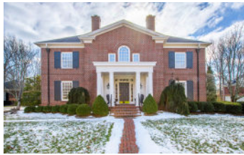
13 Wiveliscombe $1,250,000