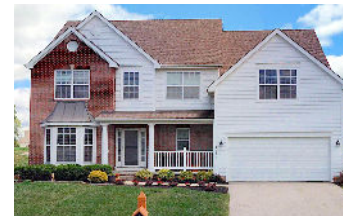
7129 Connaught Drive $579,900