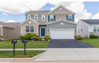
5970 Ballydugan Drive $377,000