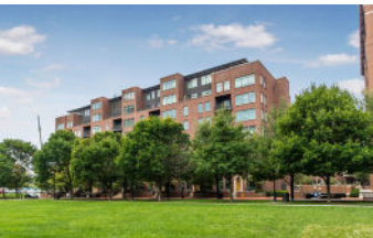
250 Daniel Burnham Square $430,000