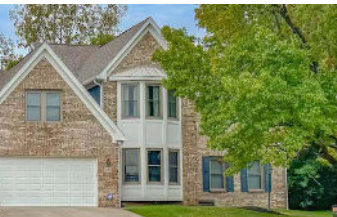
1081 Arcaro Court $535,000