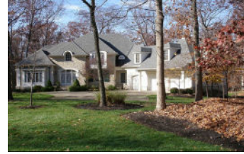
7325 Duncans Glen Drive $865,000