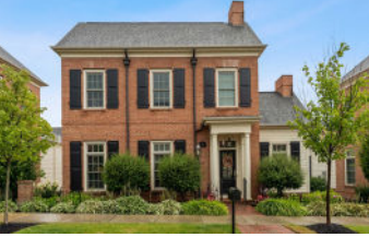
85 Keswick Drive $950,000