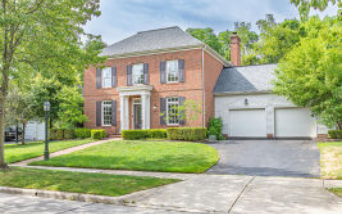
7588 Alpath Road $940,000