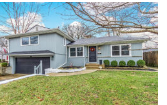
68 Harding Road $407,500