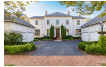
15 Hays Town $1,415,100