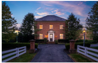
6939 Lambton Park Road $1,800,000