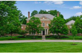
2 Albery Loop $2,250,000

www.NewAlbanyOhio.com | 614-939-1234 | Info@ThomasRiddle.com