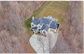
8084 Bevelhymmer Road $2,060,000