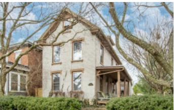
192 Thurman Avenue $510,000