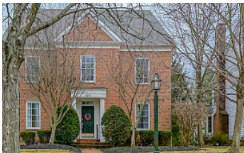
4490 Ackerly Farm Road $745,000