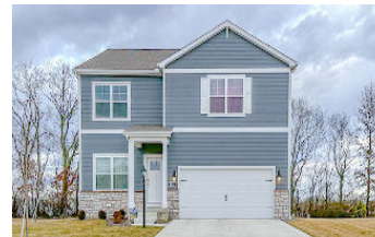
234 Carrowmoore Drive $478,900