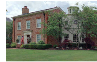
7537 Lambton Park Road $1,335,000