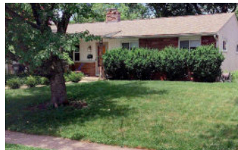
364 Franklin Court $425,000