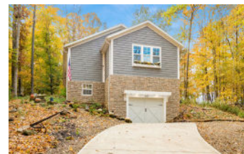
461 Grand Ridge Drive $325,000