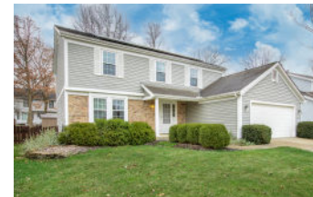
4200 Boulder Dam Drive $412,000