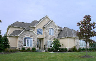
4444 Hampton Drive $957,000